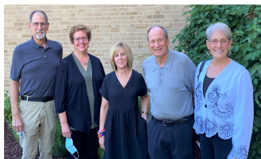
Temple Presidents Club