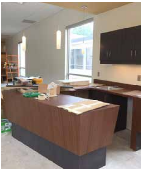
A coffee bar is part of the large meeting space