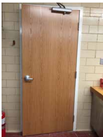
New door from the kitchen to the Resource Center hallway