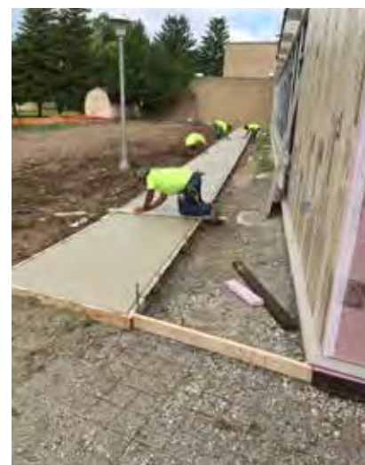
New sidewalks behind the Resource Center