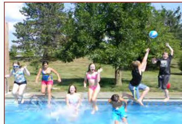
Junior Youth Group Kick-Off Pool Party in August

Please let the Temple office know your college student's email and address so we can stay in touch.