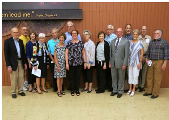
L'Dor Vador Legacy Society 2018