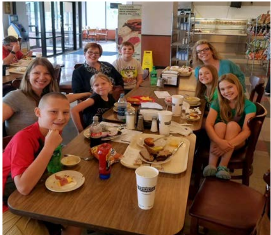
The Temple's first session GUCI campers and their moms shared lunch at Shapiro's Deli in Indianapolis before drop-off in June at Goldman Union Camp Institute in Zionsville.

I look forward to meeting more Temple members and working with the rabbi, staff, and congregants.