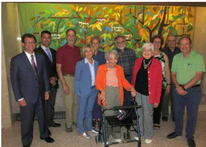
Lots of Temple Presidents - past, present, and future - at the Annual meeting.