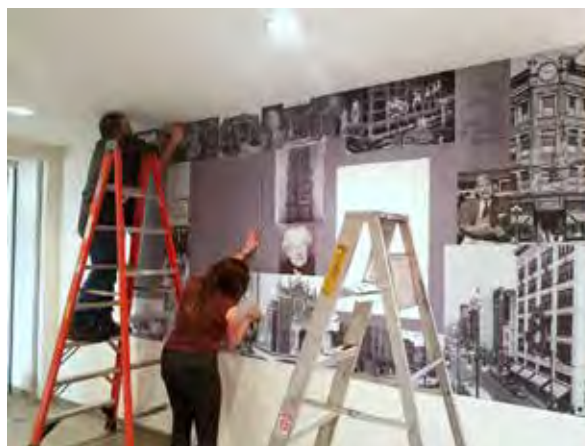
GraphX Direct staff install the new history display in the hallway leading to the Madge Rothschild Resource Center.

I hope you will consider attending and participate in whatever way inspires you. Thank you for your contributions, commitment, and resolve because we are truly a community rich in strength and character.