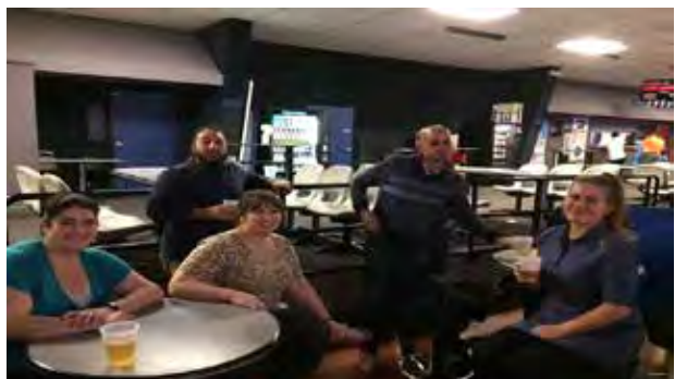
Members of the Temple's Fort YAD (Young Adult Division) for 20s and 30s celebrated Hanukkah and shared an evening of bowling.