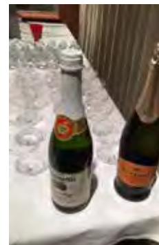
We shared the glow of Hanukkah candles, flavors of sufganiyot, and glasses of bubbly for the New Year in late December.