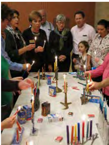
The Temple's annual Hanukkah celebration in December included a beautiful group candle lighting and latkes.

We appreciate everyone who donated pasta for our December Food Drive. Items helped support the food bank at Wellspring Interfaith Social Services.