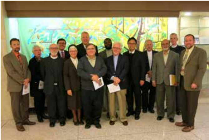
The Temple hosted clergy and representatives from 13 congregations for the community Interfaith Thanksgiving Service in November.