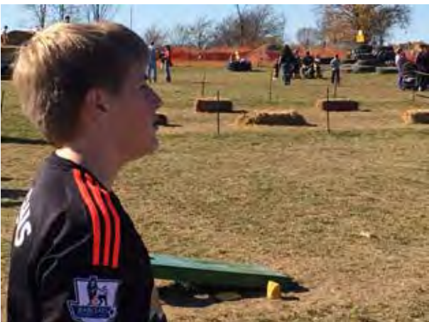
Our Junior Youth Group for middle school students enjoyed a fall afternoon at a corn maze.