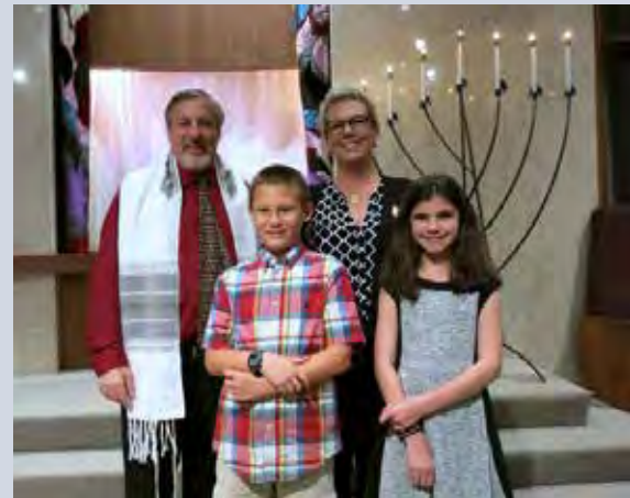
Our fifth-grade students received a personalized prayer book on Friday, October 20 during the Shabbat service to celebrate the start of their b'nei mitzvah studies.