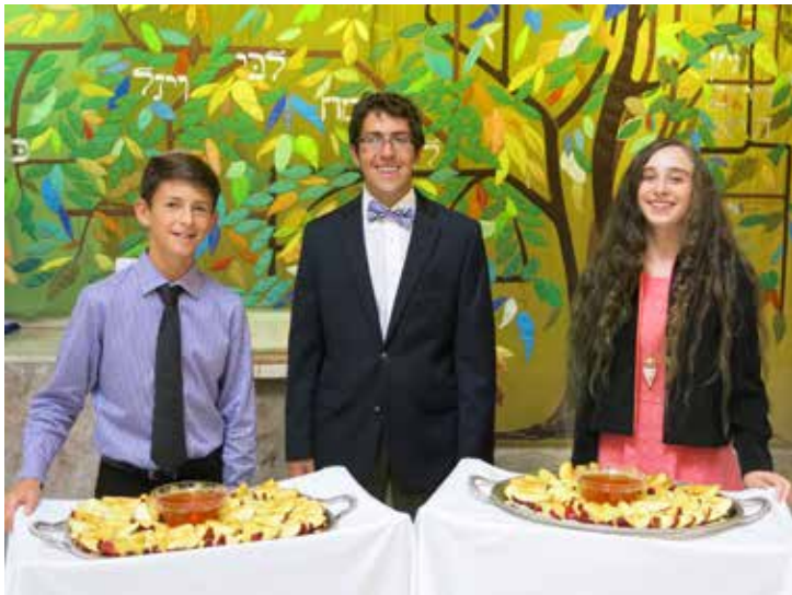
FOrTY members served apples and honey to congregants after Rosh Hashanah morning services.