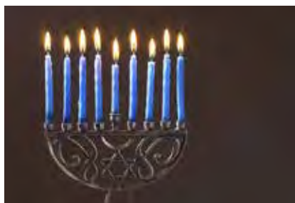
Hanukkah Begins on Sunday evening, December 6

Please support this important community event and the strong bonds we share with people of faith in the Fort Wayne community. Donations collected at the service will support St. Mary's Parish Soup Kitchen. A reception will follow the service.