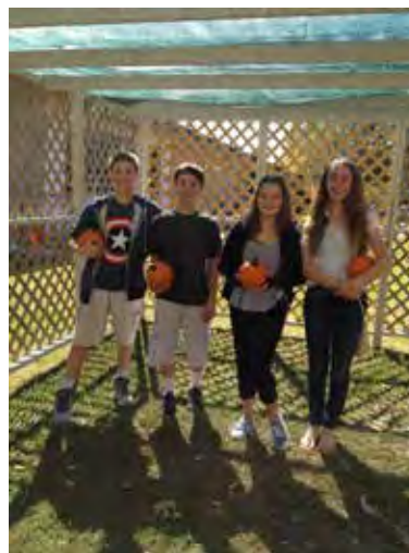
Middle school students enjoy the Temple's sukkah on a beautiful fall day.