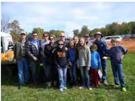
Junior Youth Group for students in grades 6-8 and their families celebrated the fall holidays with a trip to a corn maze in Waterloo.