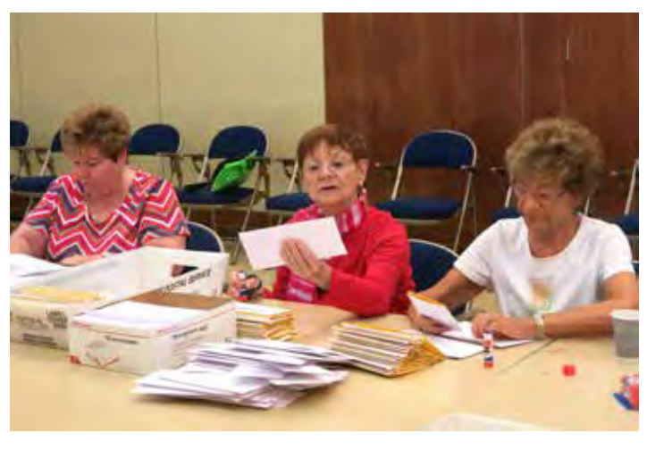
Volunteers prepare the corned beef fundraising mailing.