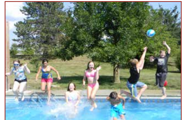
Junior Youth Group Kick-Off Pool Party in August

Please let the Temple office know your college student's email and address so we can stay in touch.