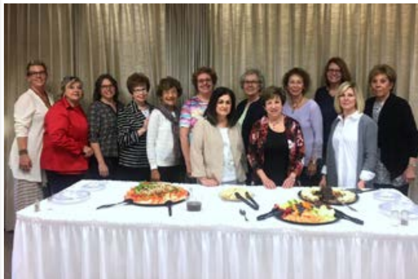
Celebrating the end of the 8th year of Thoughtful Thursdays. See page 10 for additional photos.