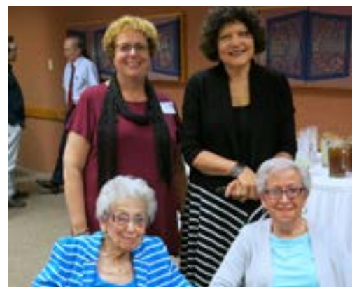
Four Past Presidents