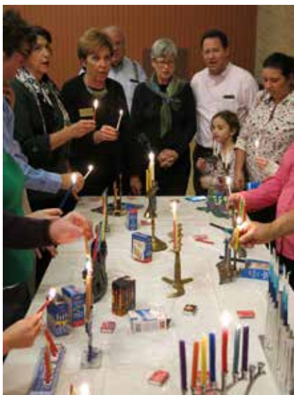
The Temple's annual Hanukkah celebration in December included a beautiful group candle lighting and latkes.

We appreciate everyone who donated pasta for our December Food Drive. Items helped support the food bank at Wellspring Interfaith Social Services.