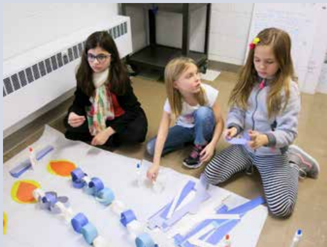
Religious School students & friends build a hanukiah out of canned goods to support Thoughtful Thursdays and Brightpoint families.